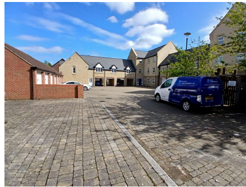
Car Park (Vehicle Parking)