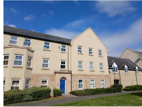
Roofing (Tiles and Cladding)