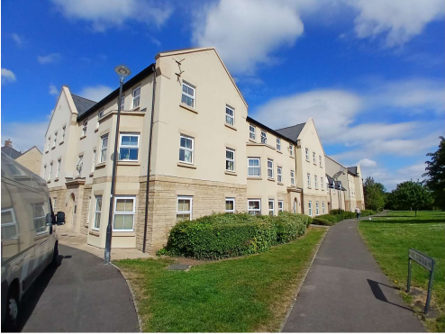
Exterior Structure (The Building)