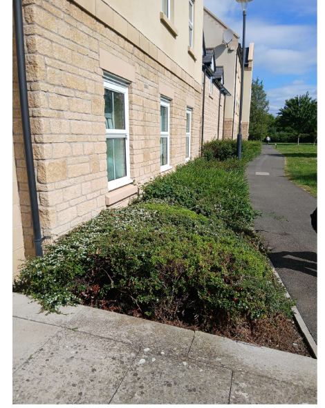
Communal Grounds (Gardens and Common Areas)