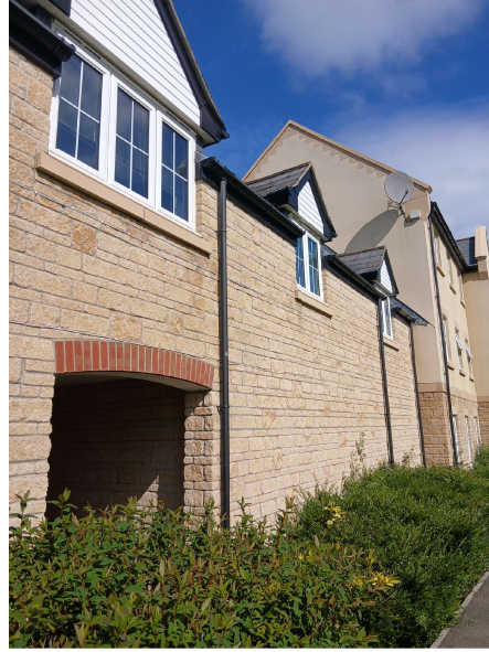
Guttering (Gutters and Fascia)