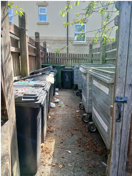
Bin Store (Waste Disposal Area)